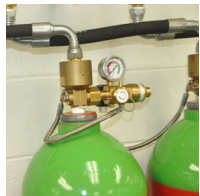
Quick-Connect Actuation Hose